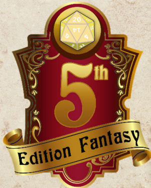
5th Edition Fantasy Logo used with permission of Fat Goblin Games